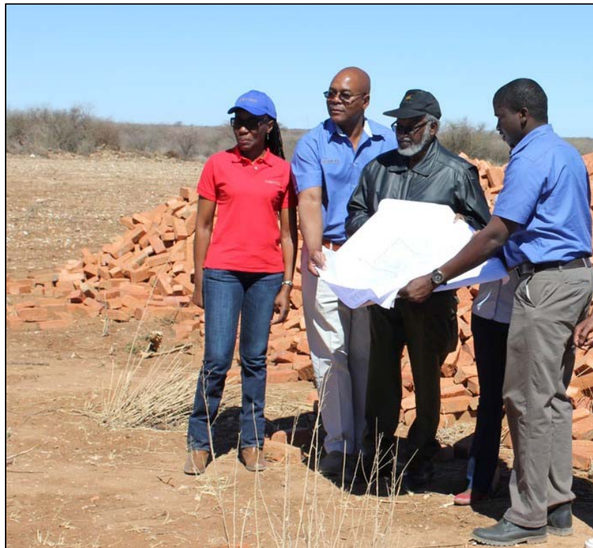
His Excellency, Dr Sam Nujoma with co-workers at the Etunda site where the construction will begin soon.